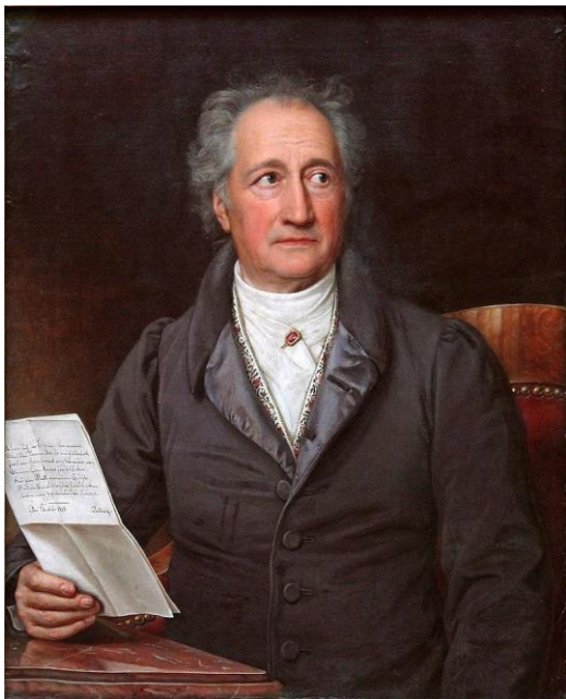
Johann Wolfgang von Goethe, 1749-1832 by Joseph Karl Stieler